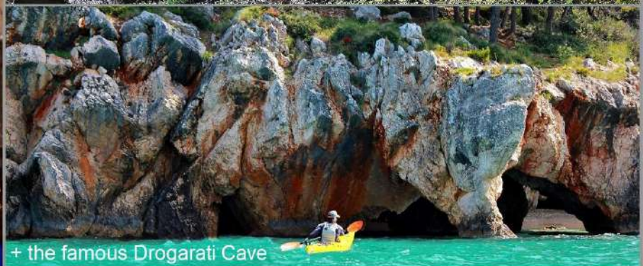
+ the famous Drogarati Cave