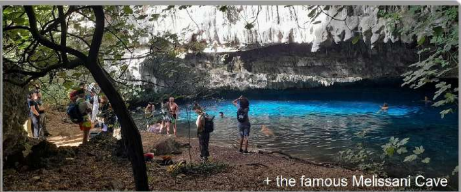
+ the famous Melissani Cave